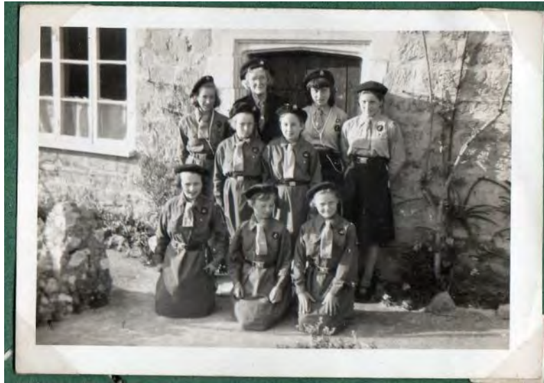
Askerswell Guides 1955