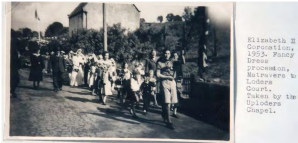
Elizabeth II Coronation, 1953. Fancy Dress procession, Matravers to Loders Court.