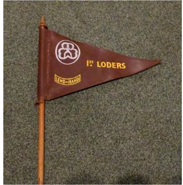
Brownies Guides c1975