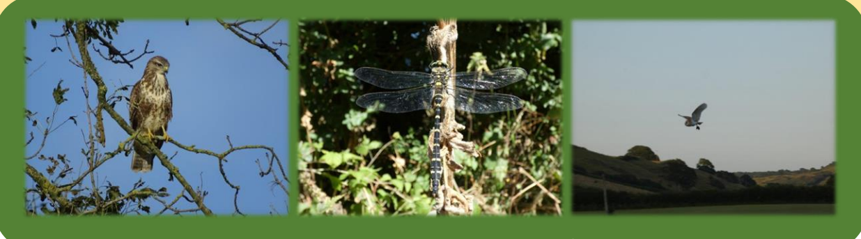
Loders wildlife images

"WE ARE THE FIRST GENERATION TO FEEL THE IMPACT OF CLIMATE CHANGE AND THE LAST GENERATION THAT CAN DO ANYTHING ABOUT IT."