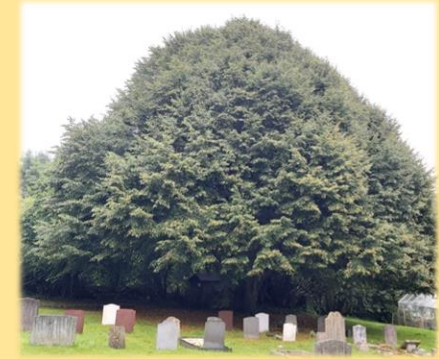
Lime Tree, Loders Cemetery

• Loders Parish Council continue to invite you to send in photos of favourite trees round the parish or any new trees that you may have planted in your own garden. You will find where Veteran Trees are in Loders Parish by exploring the Dorset Explorer website: <a href="https://gi.dorsetcouncil.gov.uk/explorer/">https://gi.dorsetcouncil.gov.uk/explorer/</a> Once on the site type in Loders Parish and search through the options available until you find Veteran Trees. It is an interesting tool for showing what is in your village. Should you know of any other older trees that you consider to be special please email us with location, details, and photos.