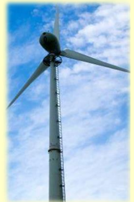
50kW wind turbine at Salway Ash supplying 14 homes in the Bridport area

Next Steps: to hold a community meeting with Derek Moss and other expert speakers followed by discussion to arrive at a collective view in the parish of the best way forward.