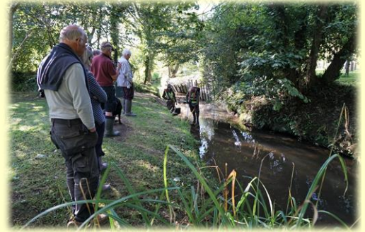
Asker River Fish Survey, Well Plot September

In doing all of this, over 70 people have engaged with the project, including eight skilled citizen scientists who monitor water quality over the summer months.