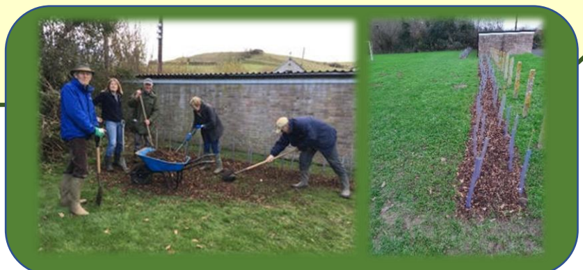
Hedge Planting at Well Plot in December

Those volunteers who turned up on the day with great enthusiasm to get the job done despite the cold, those who had volunteered but were unable to make the change of date, to Forest & Tree Care for their support in supplying and delivering bark mulch and to the resident who helped collect the turf cutter then decided to do the job himself before returning it!