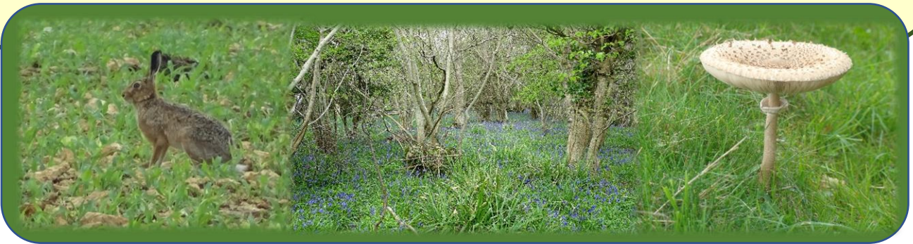
Loders Wildlife

Loders Parish Council are compiling a list of relevant and informative websites to add to those currently available on our website. Once an open meeting has been held, there will be an opportunity to provide more information and get community feedback. Keep looking on our website for updates on local and national policies.